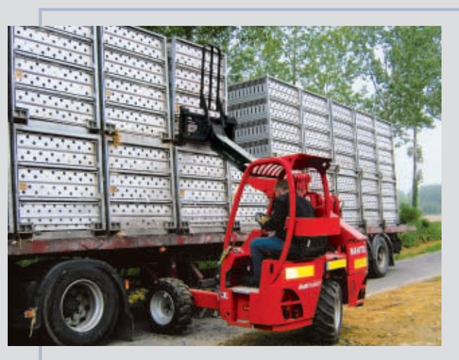
Enables you to offload your lorry with the best visibility ever.