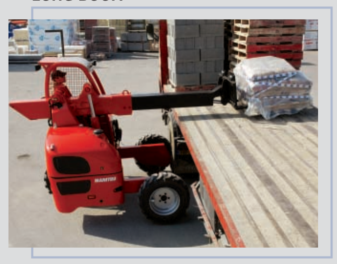
Enables you to offload your lorry from one side: less space required to operate & more time saving.