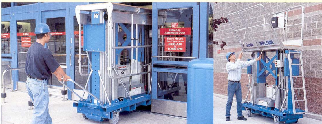
Rolls through a single doorway.