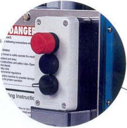
Auxiliary platform lowering feature